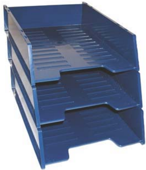
I 60 Document Tray →