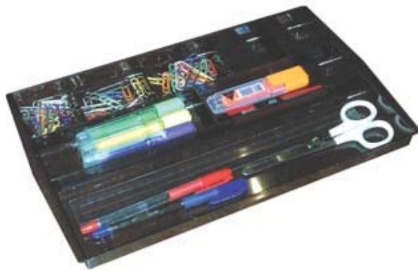
← I 70 Drawer Tidy