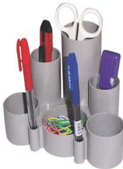
← I 30 Desk Tidy